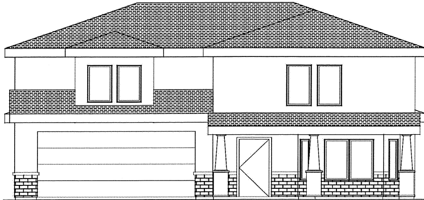
FRONT "B" ELEVATION

Is proud to introduce Semi-Custom Homes by Holt Custom Homes, Developed by Golba Group Construction and Development