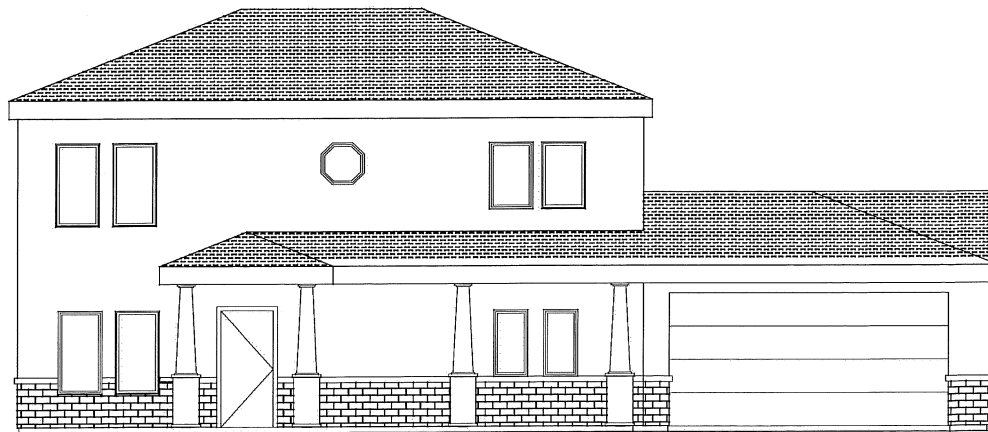
FRONT "B" ELEVATION

Is proud to introduce Semi-Custom Homes by Holt Custom Homes, Developed by Golba Group Construction and Development