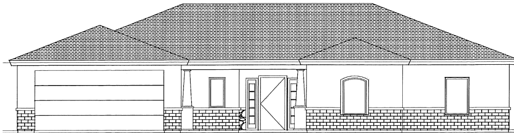
FRONT "B" ELEVATION